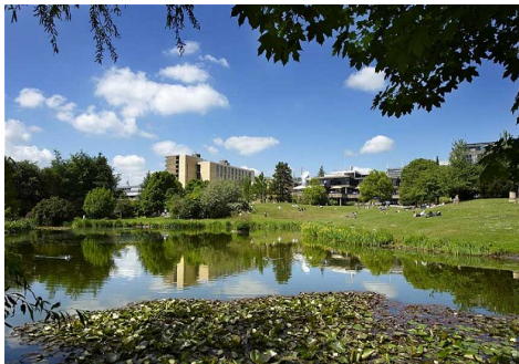
Campus of the University of Bath (the venue is behind the trees on the left!)

Venue: Building 6 West, lecture theatre 6W 1.1, University of Bath.