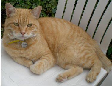
Figure 2: Randolph