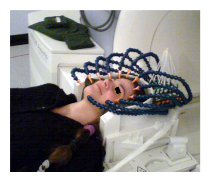
Fig. 1 The experimental apparatus

Uni university level, Sec secondary school level, Y yes, N no, L/D light/darkness sensitivity Aetiology abbreviations: RoP retinopathy of prematurity, Ret pigm retinitis pigmentosa