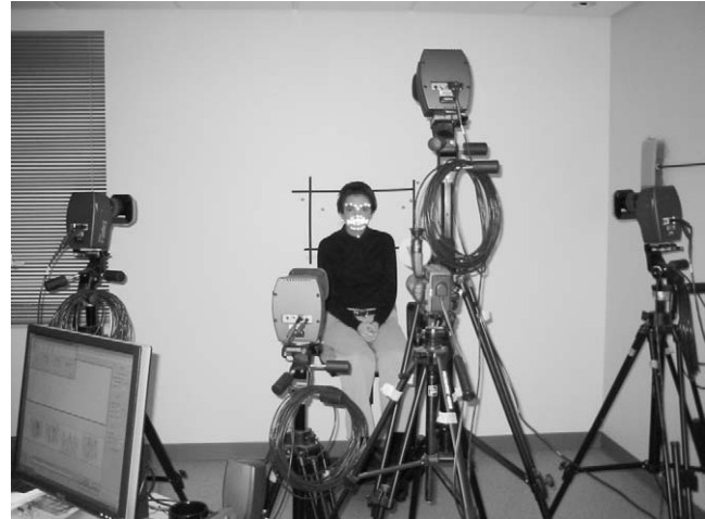
FIGURE 1 Camera arrangements and subject position for facial movement capture (note that markers appear larger than actual size because of light reflection from the cameras).

Participants who met the selection criteria were recruited and screened at the University of North Carolina (UNC) Craniofacial Center, the Graduate Orthodontics Clinic, the Pediatric Dentistry Clinic, and the Orthodontic Faculty Practice of UNC. No participant was excluded from participation on the basis of sex, race, or ethnic background. The purpose and protocol of the study was explained to the participants(s) and parent(s), and informed consent and assent was obtained. Consent