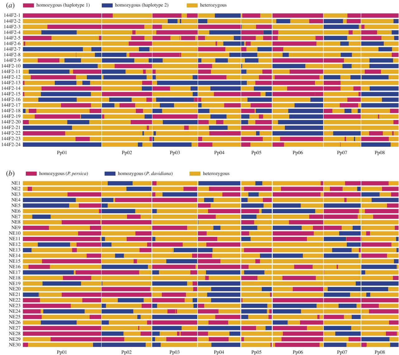
Figure 2. Graphical representation of CO recombinants. (a) Intraspecific ( P. persica ) F 2 samples, the homozygous genotype was chosen by random for each chromosome; (b) interspecific F 2 samples, the red haplotypes were derived from P. persica while the blue haplotypes were derived from its wild ancestor P. davidiana .

material, table S5) with a combined span of approximately 19-Mbp and 14 CO coldspots (10 000 randomizations, p < 0.05 ; electronic supplementary material, table S6), with a combined length of 53.8 Mbp. In other words, approximately 29% of CO events are clustered within approximately 8.6% of the entire genome (electronic supplementary material, table S5), and approximately 23.9% of the genome is devoid of the CO events (electronic supplementary material, table S6). The average recombination rate in hotspot regions ( 8.04 \text{ cM Mb}^{-1} ) is about 16.8-fold higher than that in the cold-spot regions ( 0.48 \text{ cM Mb}^{-1} ; t -test, p = 1.58 \times 10^{-17} ). Gene ontology analysis reveals a slight enrichment in serine-type endopeptidase activity under molecular function near hotspots (electronic supplementary material, figure S4), while coldspots are enriched for cysteine-type peptidase activity or other various binding activities, and most genes were related to the macromolecule metabolic process (electronic supplementary material, figure S5).