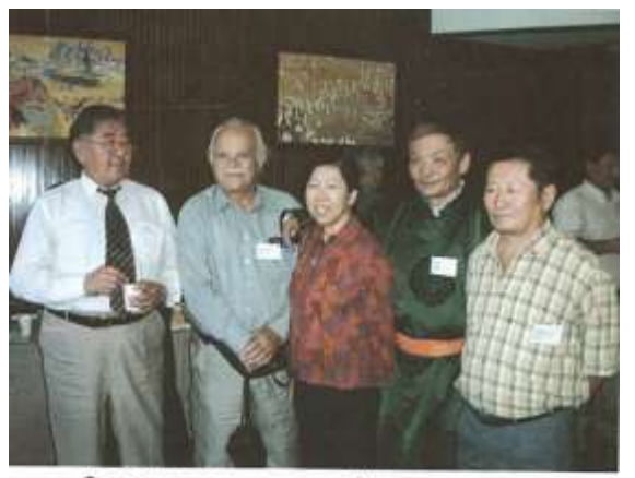
Figure 5: During an international conference in Mongolia, 2006